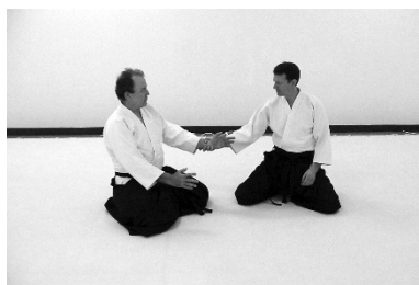
Suwari Waza Katatetori